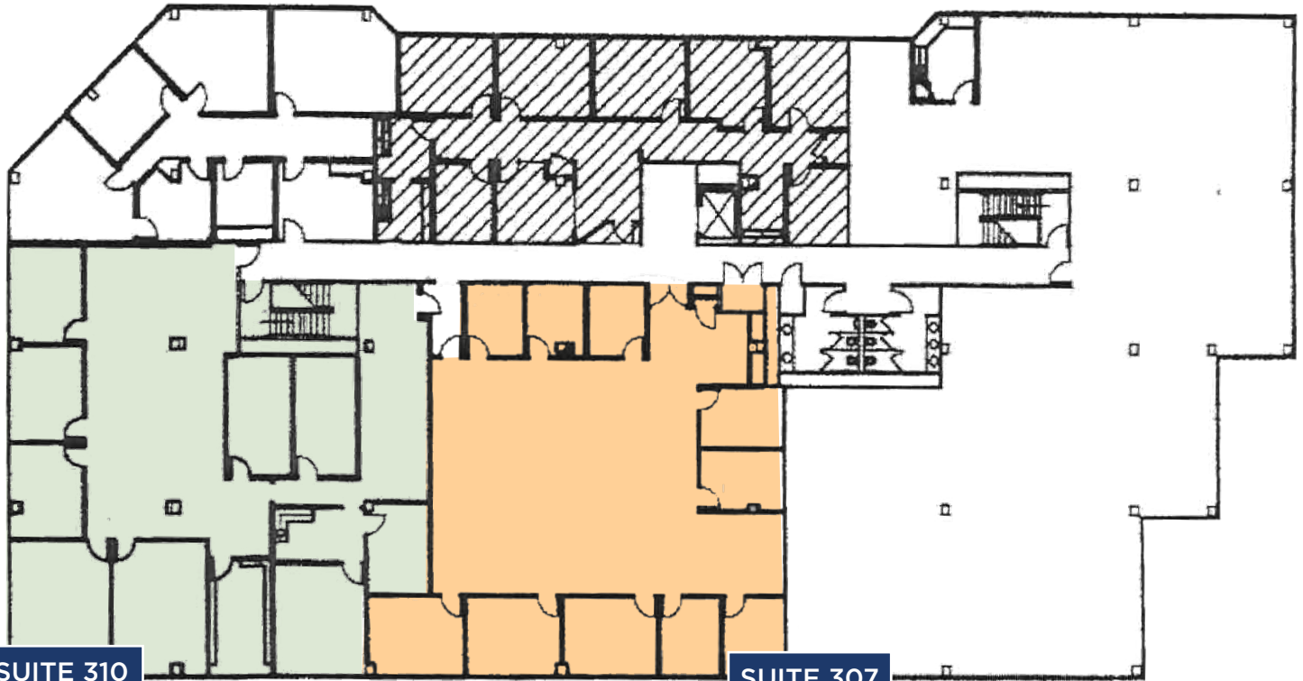
SUITE 310 4,212 SF